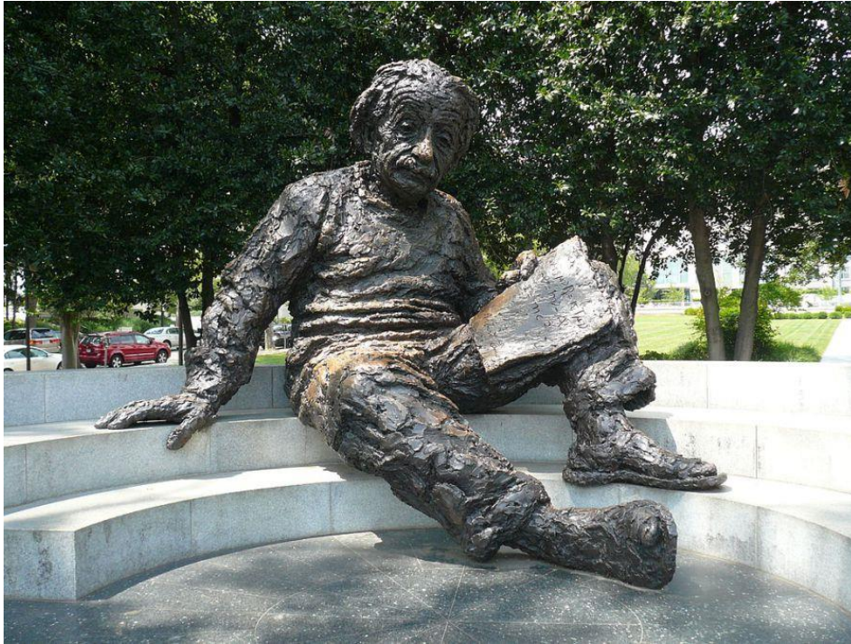
Albert Einstein Memorial, National Academy of Sciences, Washington D.C.

Running the Cherry Blossom 10 miler in downtown Washington D.C., I spied a massive Albert Einstein statue from the corner of my eye. I had never seen such a huge Einstein before. In a city full of “generals on a horse” memorials, I was intrigued. “ Constitution. Einstein. Must Return, ” I tried to burn into my running brain.