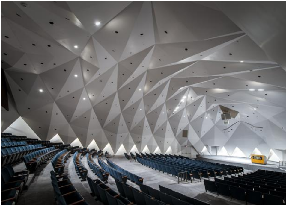
National Academy of Sciences Auditorium

Besides beautiful art, CPNAS also hosts other free events for the public and I cannot wait to attend one of them in their striking auditorium .