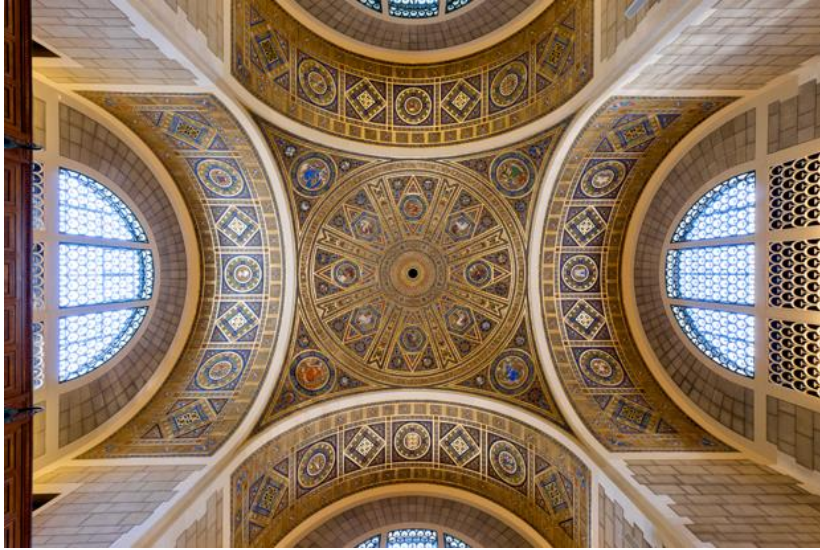
Dome of the Great Hall of National Academy of Sciences

After you have had your fill of this beauty, wander into the exhibition halls of the Cultural Programs of NAS (CPNAS) . The exhibits are an engaging intersection of Science and Art.